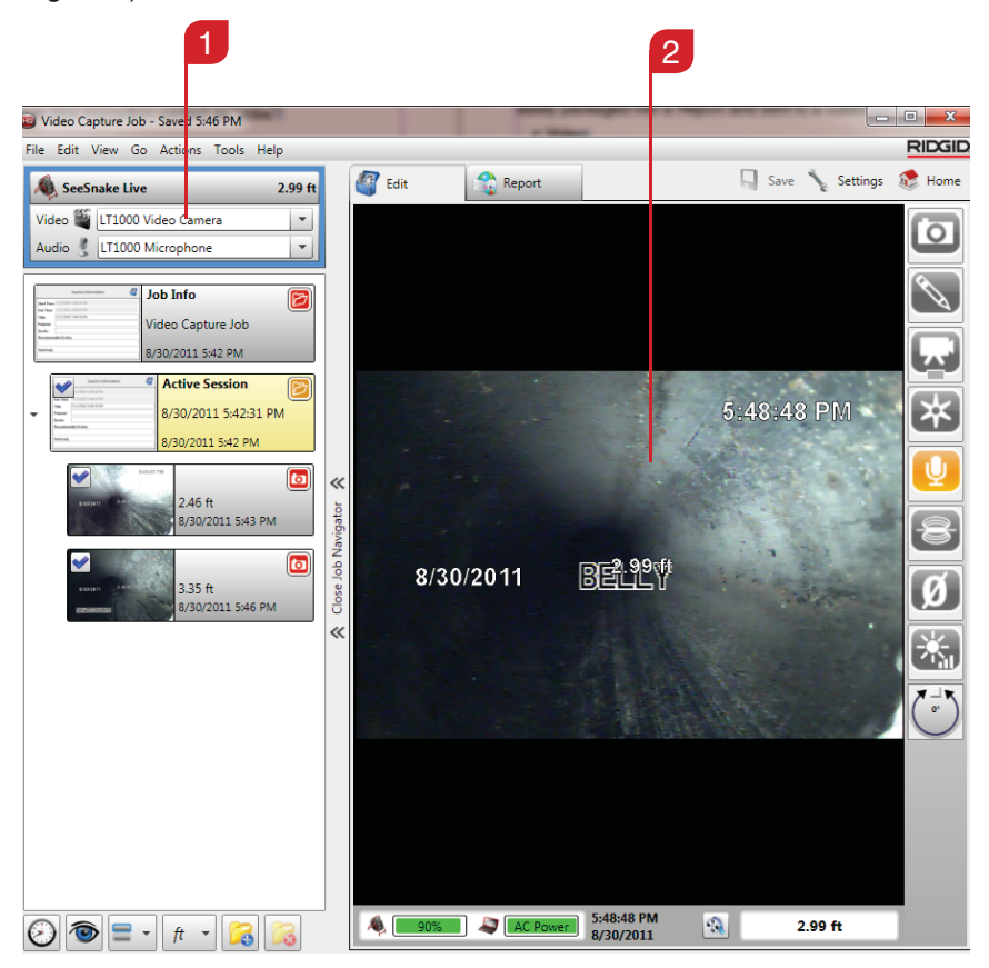
Figure 1 - SeeSnake Live View in the Job Window

When performing a pipe inspection using the LT1000 and a SeeSnake Reel, view the image from the inspection camera in the box labeled "SeeSnake Live" or click the box to minimize SeeSnake Live " (See Item 1, Figure 1) and to expand the camera view in the View Port (See Item 1, Figure 1).