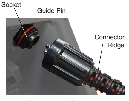
Outer Locking Sleeve

Only twist the outer locking sleeve. To prevent damage to the pins, never bend or twist the connector.