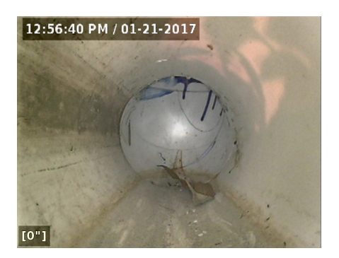
With Pipe Guide