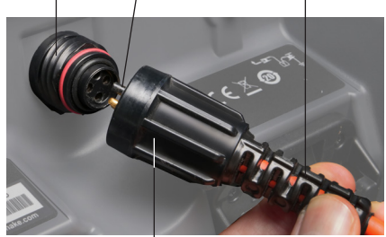
Outer Locking Sleeve