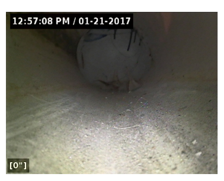
Without Pipe Guide

Pipe guides can easily be installed, adjusted, and removed to provide better camera and push cable movement in the pipe. For small pipes, tubes, or voids, the camera head guide helps push the camera through stubborn fittings. For larger pipes, ball guides center the camera for better visibility and light illumination.