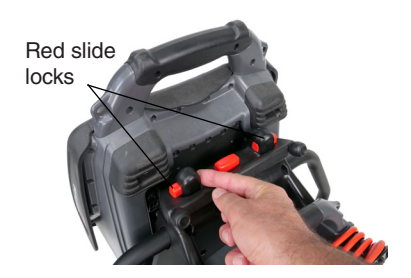
Front Cover Handle