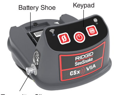
Transmitter Clip-On Terminal