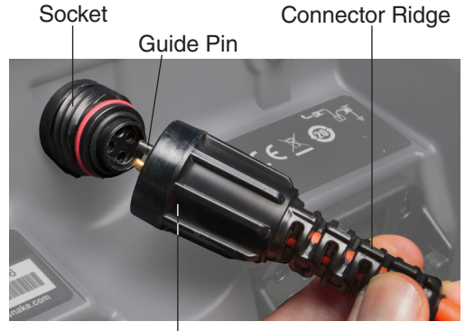
Outer Locking Sleeve

Only twist the outer locking sleeve. Never bend or twist the connector.