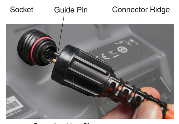
Outer Locking Sleeve

Only twist the outer locking sleeve. Never bend or twist the connector.